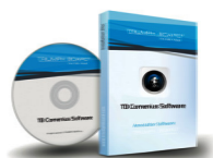
TB Comenius Office